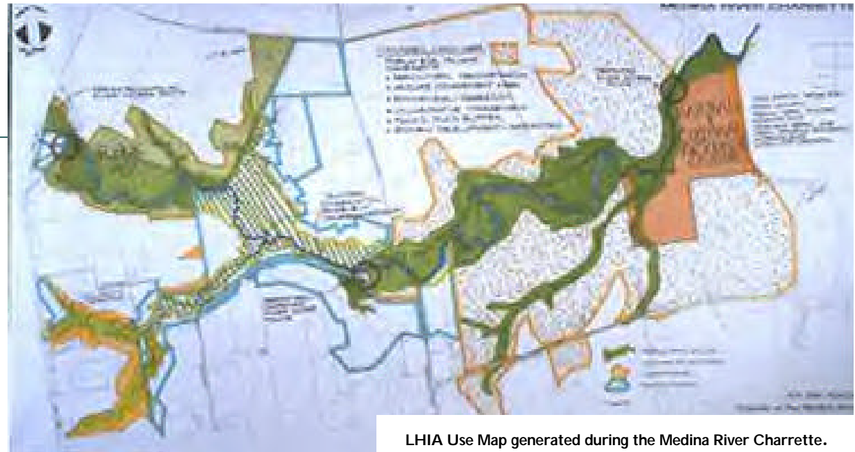
LHIA Use Map generated during the Medina River Charrette.