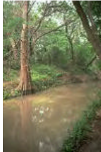
Medina River Bottom

To provide a place for organizations to enjoy the outdoors in a responsible and managed environment. Envisioned recreational opportunities include providing campgrounds for families and for youth groups, hiking biking and bridal trailways, nature watching, and other organized open space activities that would allow the public to experience the vision of the Land Heritage Institute of the Americas.