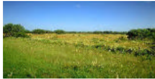
Spring in South Pasture

The mission of the Land Heritage Institute Foundation is to acquire, maintain, preserve and develop the Medina River Property as a public open space, consistent with the Land Heritage Institute of the Americas Plan prepared by Texas A & M University, and to own and operate the facility known as the Land Heritage Institute of the Americas for the following charitable purposes: