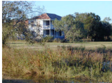
Watson/Presnall Ranch House

Located in South Bexar County along the Medina River Owned and Operated by the Land Heritage Institute Foundation