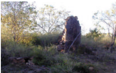
Stoelje House Ruins (early 1800's)